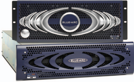
BlueArc Network Storage Servers