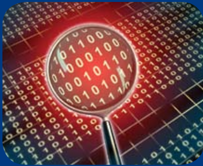
Electronic Discovery, Digital Forensics, Legal Consulting

Legis Discovery counts on BlueArc to drive its growing business in electronic discovery. Employed by major corporations and law firms to make sure they have the best information at their disposal before heading to court, Legis Discovery combines its employees' deep knowledge of forensic science with the unparalleled throughput, scalability and performance of BlueArc's Titan network storage system to do a better job, faster and at a lower cost than the competition.